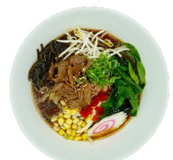
R3. BEEF RAMEN