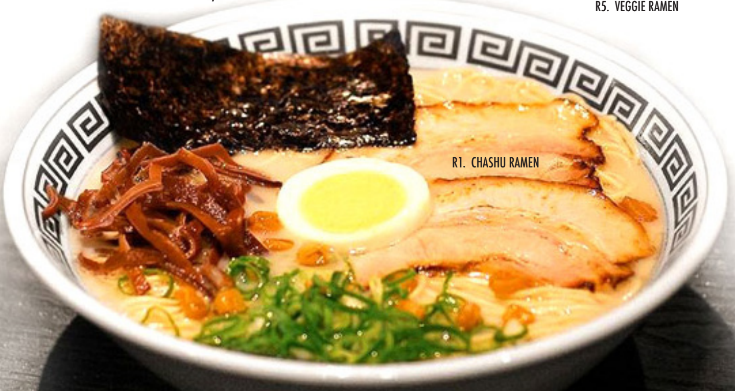
R1. CHASHU RAMEN