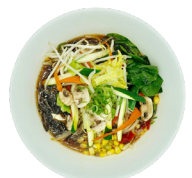
R5. VEGGIE RAMEN