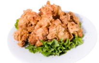
A10. CHICKEN KARAAGE