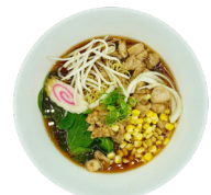
R4. CHICKEN RAMEN