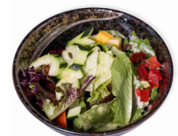
SPRING MIX SALAD